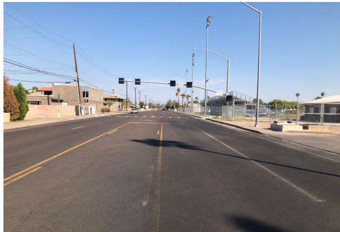
Rio Salado Pkwy PHB*