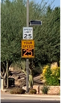
Traffic Calming Study: