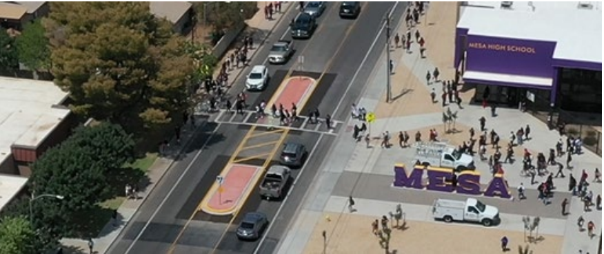
Mesa HS Pedestrian Refuge