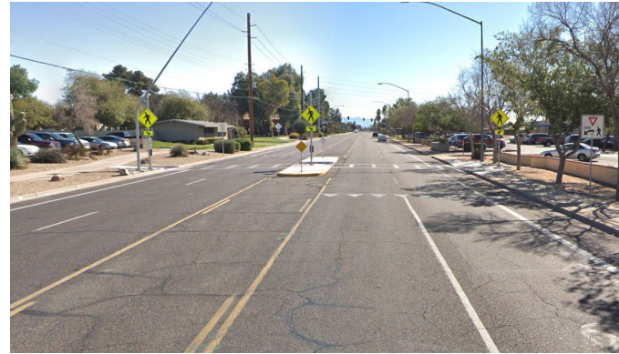
Kleinman Park RRFB*