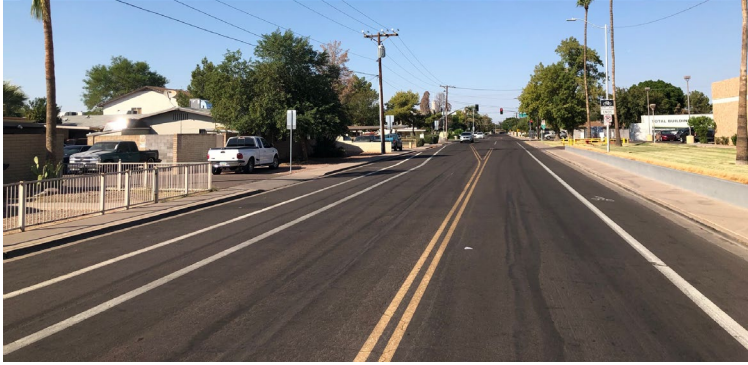
Westwood HS Bike Lanes