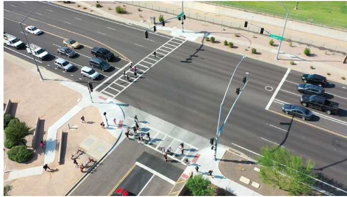
Highland JH Traffic Signal*