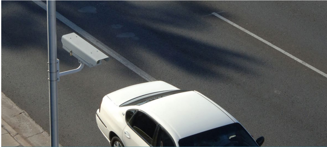
Red-Light and Speed-on-Green Cameras